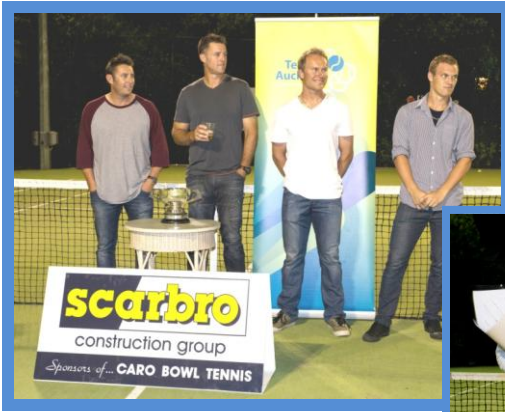
2013 Men's Winners Head Parnell