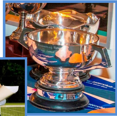
2013 Women's Winners Zealandia Sunnyhills